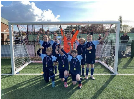
Y6 Boys Football Champions 2021/22

67 boys (92%) 53 girls (91%) 25 EAL (96%) 2 out of 3 PP – (66%)