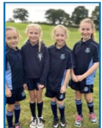
Y5 Girls Country Champions 2021/22