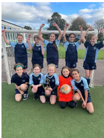
Y6 Girls Football Champions 2021/22