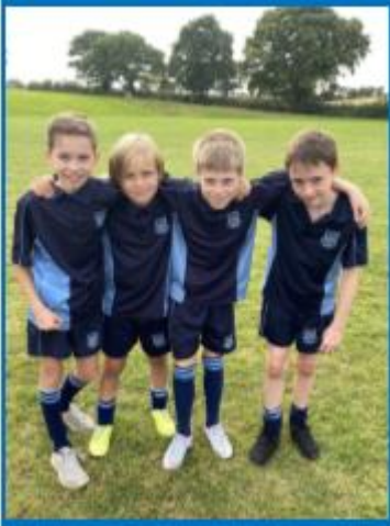
Y5 Boys Cross Country Champions 2021/22