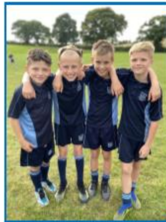
Y6 Boys Cross Country Champions 2021/22