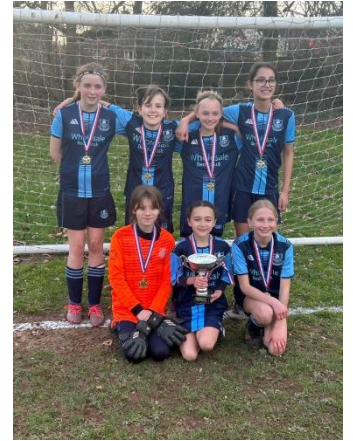
Y6 Girls SSSP Football Winners 2022/2023