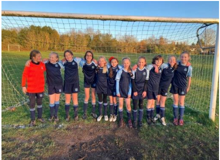
Y6 Girls Football County Runners up 2022/23