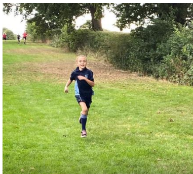
Y6 School Games Cross Country Champion 2022/2023