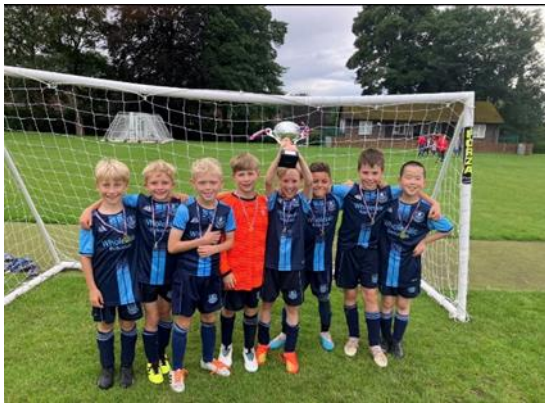
Y4 SSSP Football Winners 2022/2023