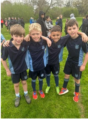
Y4 Boys School Games Cross Country Runners Up 2022/2023