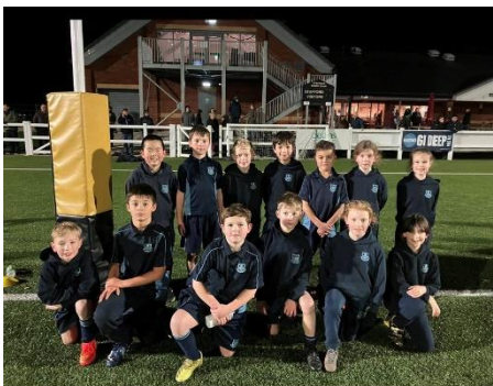
Y4 Stafford School Games Champions 2022/23