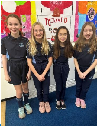
Y5 Girls Cross Country Runners up 2021/22