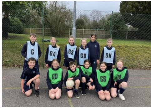
Y6 School Games Netball Runners Up 2022/2023