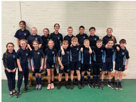
Y6 Stafford School Games Indoor athletics Champions 2022/23