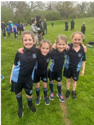
Y3 Girls School Games Cross Country Winners 2022/2023