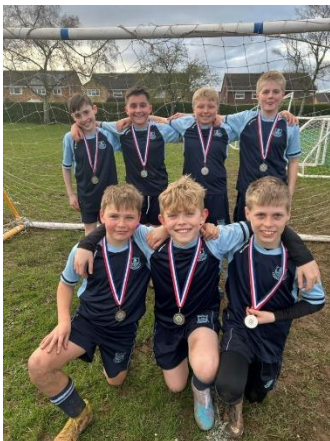
Y6 Boys Leasowes Football Runners Up 2022/2023