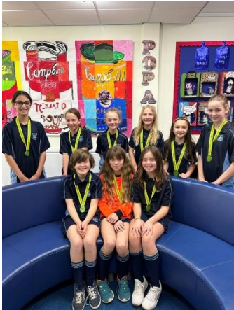
Y6 Girls Football County Runners Up 2022/2023