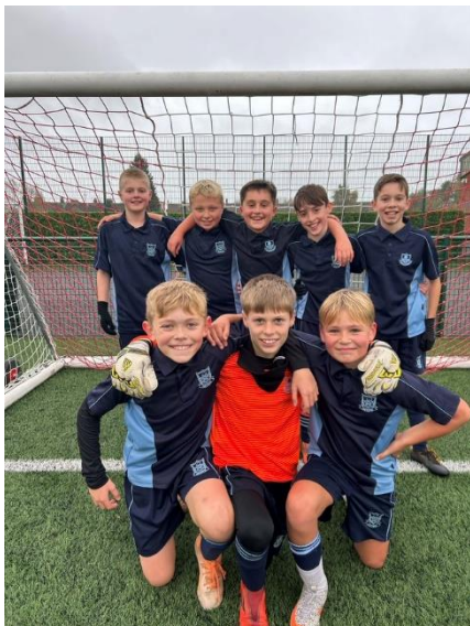
Y6 Boys School Games Football Champions 2022/23

In KS1 21 children in attendance out of 30 (70% of Y2 attended a club)