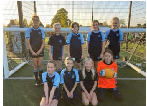
Y6 Girls School Games Football Champions 2022/23