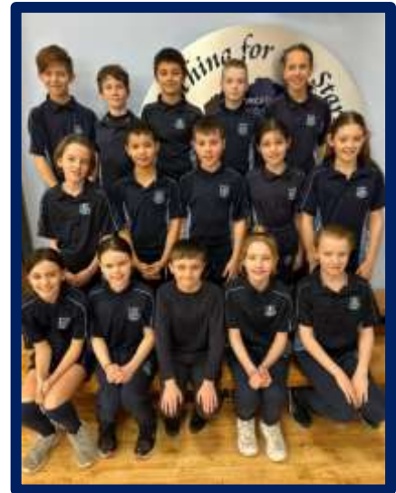
SDSSP Primary Schools Swimming Gala Runners Up