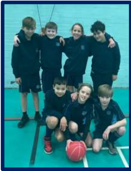
Year 5&6 mixed basketball Bronze Medal winners