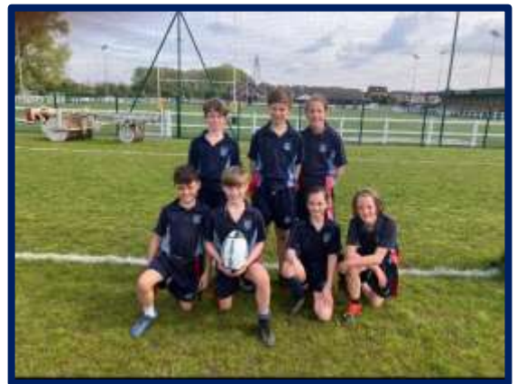
Runners up Tag Rugby Year 5 and 6 School Games Football