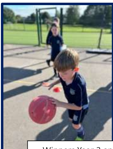
Winners Year 3 and 4 School Games Girls Football

71 (56% of KS2) different children have represented the school in sporting competitions in 2023 -2024 Interhouse Competition 2024