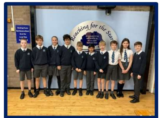
Year 5&6 Sports Leaders

7 Year 3&4 Girls Football School Games 7 (5B 2G) Year 5&6 mixed basketball 8 Walsall Schools EFL Cup Football 8 Year 3&4 Boys Football 16 (4 B 4G) Yr 3 and 4 Tag rugby 28 Y5 and Y6 Boys School Games Football - A B and C Team 10 Y5 and Y6 Girls School Games Football 16 Y5 and Y6 children Stafford Schools Sports Partnership Cross Country 7 Y5 and Y6 girls Stafford Schools Sports Partnership Girls Football 7 Y4 boys Stafford Schools Sports Partnership Boys Football 6 Y5 boys Stafford Schools Sports Partnership Boys Football 7 Y6 boys Stafford Schools Sports Partnership Boys Football 7 boys and girls Hi 5 Netball 4 Y3 Girls SDSSP Cross Country 4 Y3 Boys SDSSP Cross Country 4 Y4 Girls SDSSP Cross Country 4 Y4 Boys SDSSP Cross Country 4 Y5 Girls SDSSP Cross Country 4 Y5 Boys SDSSP Cross Country 4 Y6 Girls SDSSP Cross Country 4 Y6 Boys SDSSP Cross Country 9 Y3 and 4 Boys and Girls Stafford and Stone Football Competition