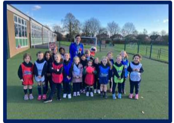
Year 2 Girls Football